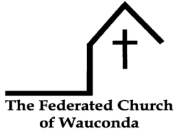
PHOTO RELEASE Federated Church of Wauconda 200 Barrington Road, Wauconda, IL 847. 526.8471 VBS 2018

I hereby grant permission for you to photograph, videotape and or to record my voice and sounds and to use any or all such photographs, videos and recordings for published products for The Federated church of Wauconda's promotion purposes.